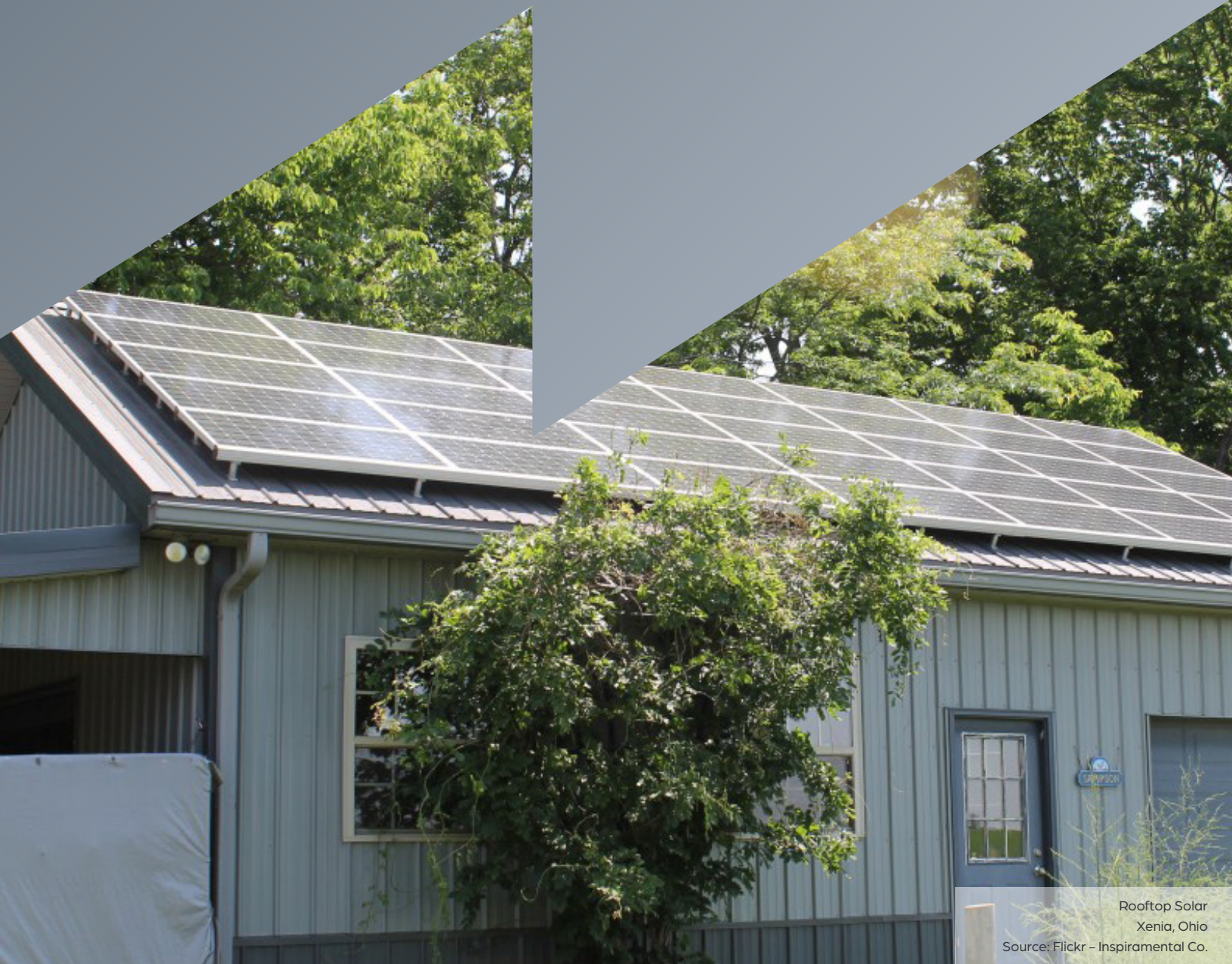
Rooftop Solar Xenia, Ohio